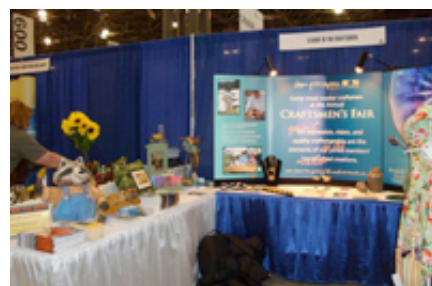
Booth from New York Times Travel Show

Along with working on the 78th Annual Craftsmen's Fair, scheduled for August 6 – 14, the staff, assisted by some of our juried members, will be representing the League at the following events: the New York Times Travel Show at the Javits Convention Center in New York City on February 25-27; NE Products Show in Portland, ME on March 12-14; Boston Gift Show on March 26; and the Made in NH Expo in Manchester on April 1-3. I plan to attend part of the Governor's Conference on Tourism, May 5-6, and the CODA (Craft Organizations Development Association) conference in Portland, ME on June 8-11. We will hold a grand opening celebration in our new facility sometime in October and the date for the 2nd Annual Auction- Get Your Craft On is scheduled for November 11. As you can see, there's a lot going on, and more to come.