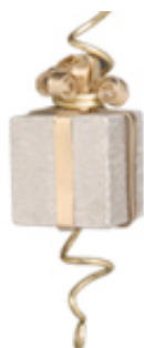
2009 Annual Ornament, The Gift by Joseph DeRobertis