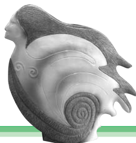
Clay sculpture by Ken Pick