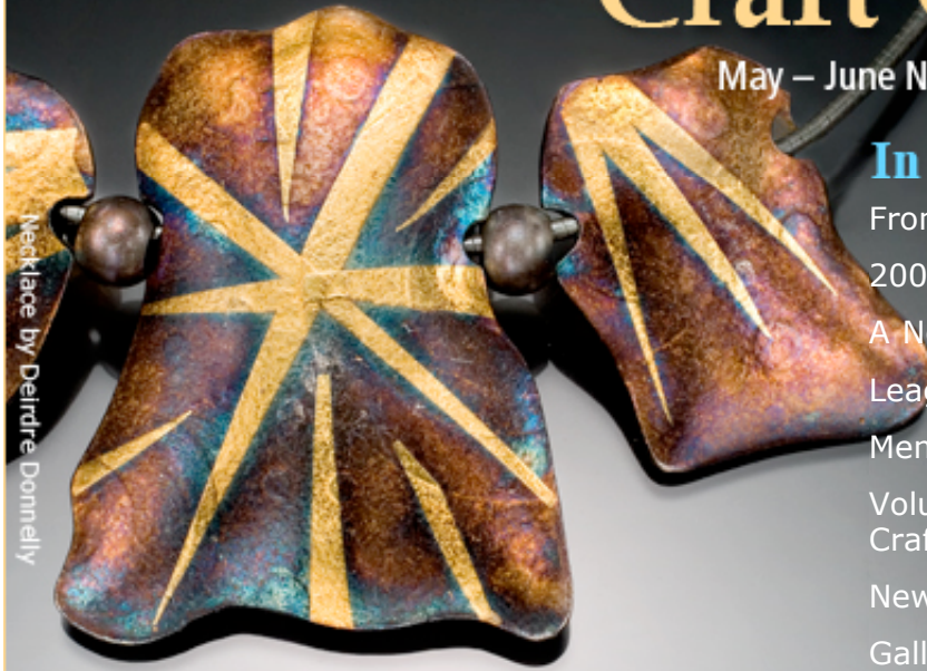
Necklace by Delirdre Donnelly

Click any of the headlines above to view the article below