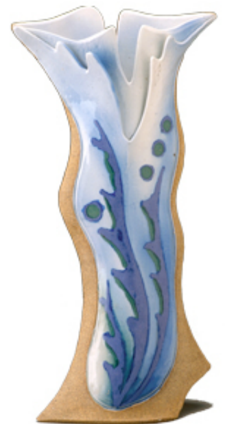
Ceramic Vase by Ken Pick