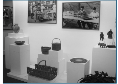
Work from the Permanent Collection from the 1930's - 60's was on display in Gallery 205 from January 19 - March 16 and was enjoyed by collectors and many visitors.