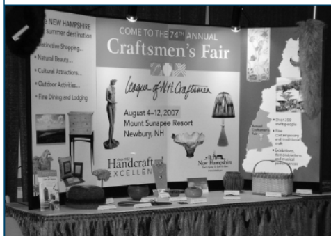
The League's exhibit at the New York Times Travel Show featured a variety of fine handcraft by League members, as well as information about the Annual Craftsmen's Fair.

The League will likely participate again next year, so League members are urged to consider doing a demonstration or working at next year's show. It has proved to be an excellent promotional opportunity. ■